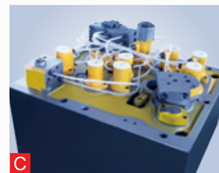
C Variable-speed drive and spindle speed selector cutaway