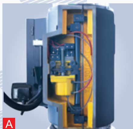
A Hydraulic system cutaway