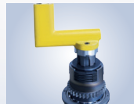
Spindle rapid-stop brake assembly