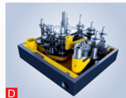
D Spindle gearbox