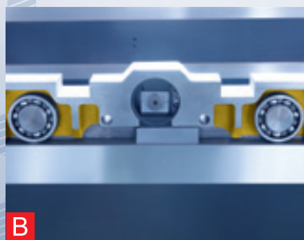
B Spindle head hydraulic clamps