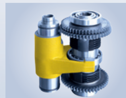
Spindle rotation direction switch